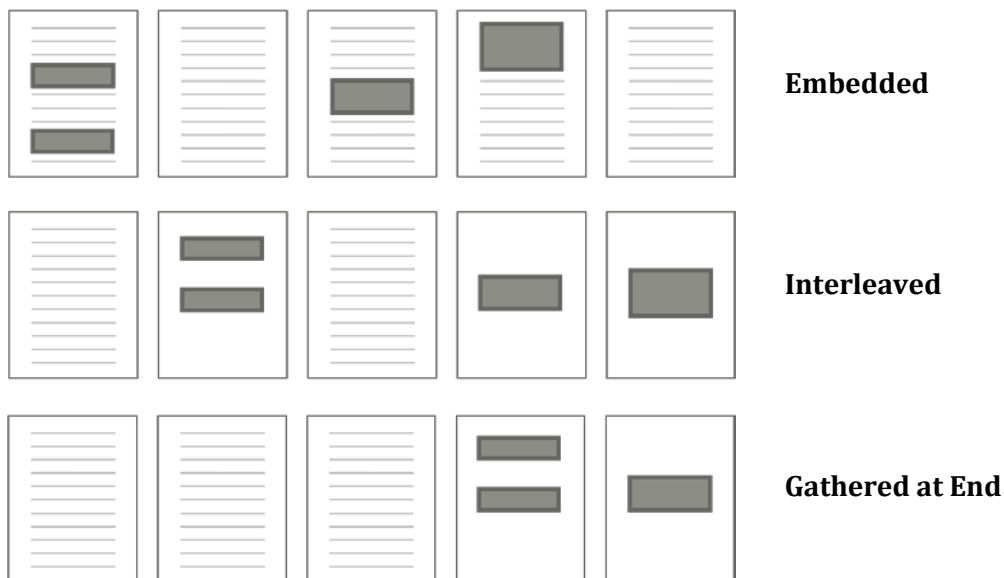
Figure 1. Three options for figure/table placement. This figure depicts the three acceptable options for placing tables and figures in your thesis. Choose one option and use it consistently throughout.